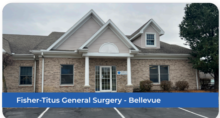
Fisher-Titus General Surgery - Bellevue

Have questions or want to schedule a consultation?